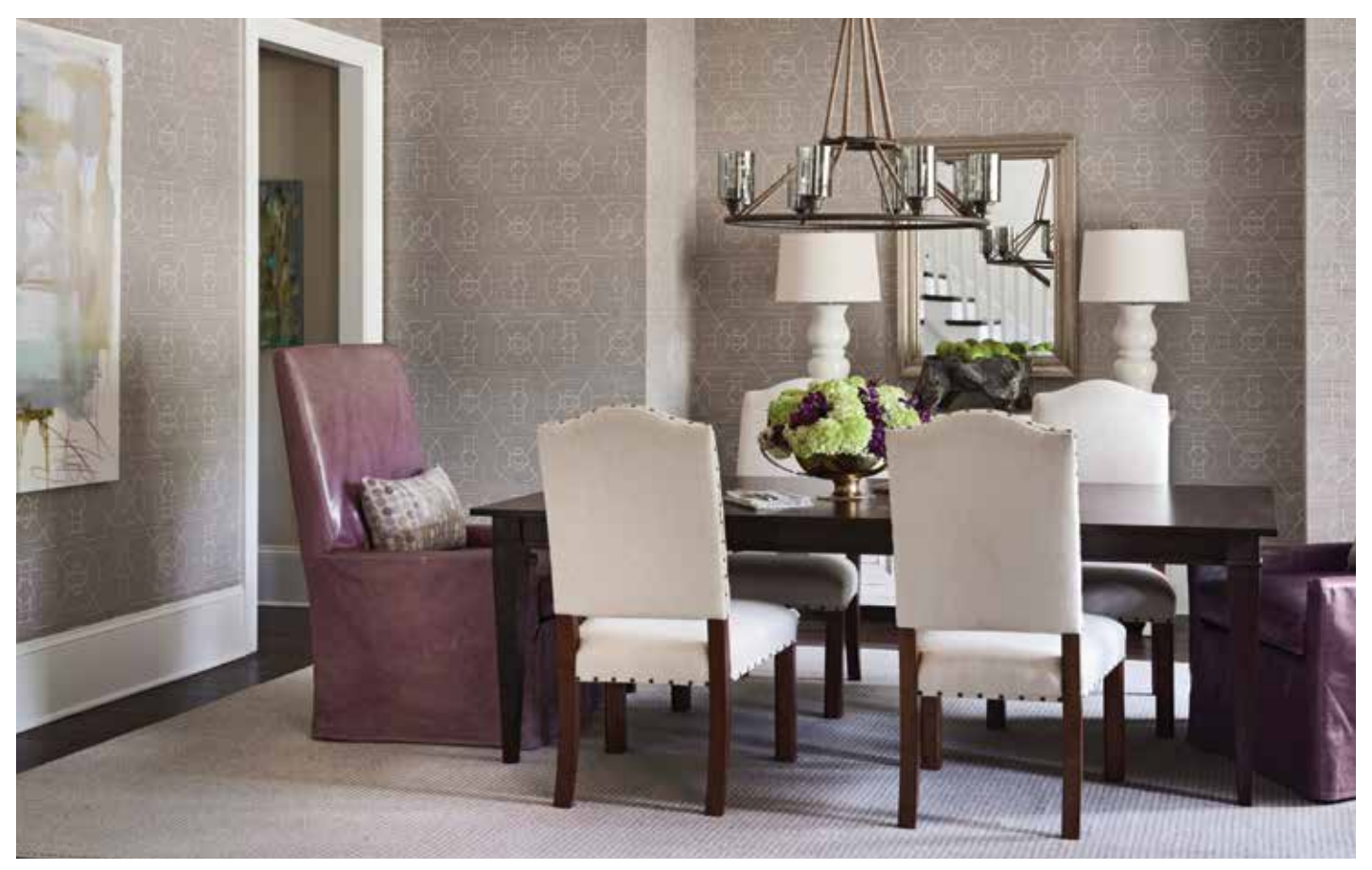
To see all the photos from this home, visit www.urbanhomemagazine.com.